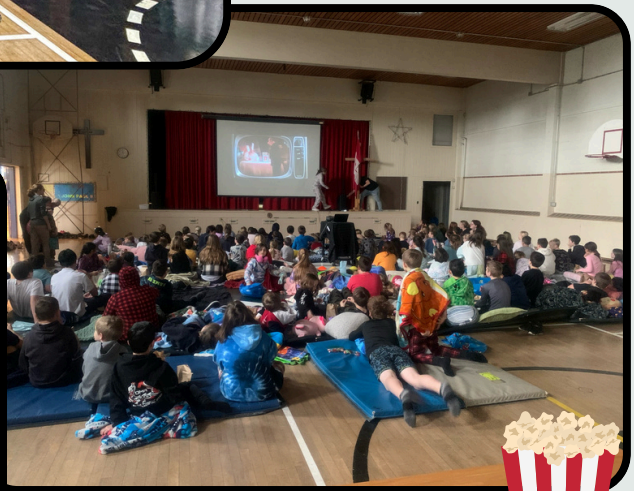
Pajama & Movie Day!